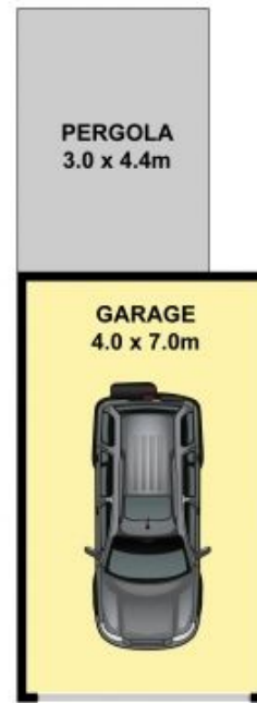
(NOT IN POSITION)

Whilst bwm.com.au has made every attempt to ensure the accuracy of the floor plan contained here, measurements are approximate and no responsibility is taken for any error, omission, or mis-statement. This plan is for illustrative purposes only.